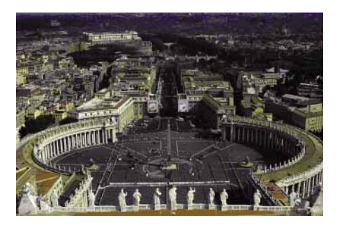
Vatican City – Home of the Popes

It is clear from these quotations that the church became a very powerful political force exerting its influence at the highest political levels. The result of this was that the church became involved in political disputes which often led to conflict and war. The principle of non-aggression that we considered at the start was not very much in evidence.