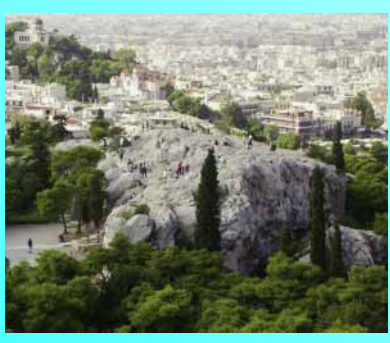
The site of the Areopagus from The Acropolis in Athens

struggle against Stoics were thus indifferent to pain or sorrow: hardships and pleasures were to be encountered with indifference. sublime Material possessions were of little significance since these could be replaced if lost, but, for them, loss of selfrespect was far more serious.