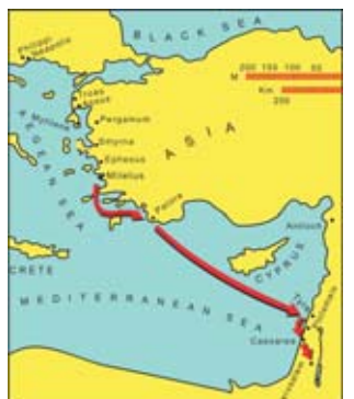
reached Jerusalem – at last!