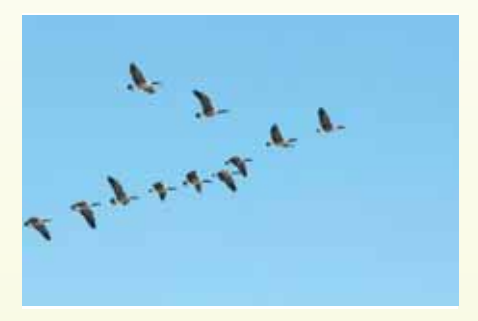
Life appeared in the sea and in the air.

"Let the waters abound with an abundance of living creatures, and let birds fly above the earth across the face of the firmament of the heavens" (1:20).