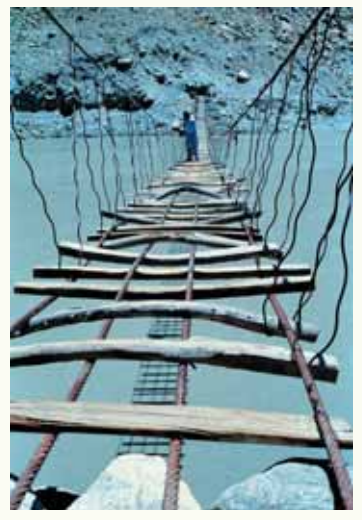
There is a way that seems right to a man, but its end is the way of death (Proverbs 14:12).

God never wanted His world to be in this state, with such widespread disease and death. But the invasion of sin into the world has spoiled the world as it was originally created. It has infected the minds and therefore the behaviour of people who would otherwise have lived in a way that pleases their Creator. Now, to a large extent, the world has abandoned a belief in the one true God, and has followed its own man-made course. Long ago the wise man said: