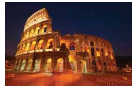
The ruins of the Coliseum in Rome where some terrible things were done, just to entertain the crowds

Undiscerning, untrustworthy, unloving, unforgiving, unmerciful; who, knowing the righteous judgment of God, that