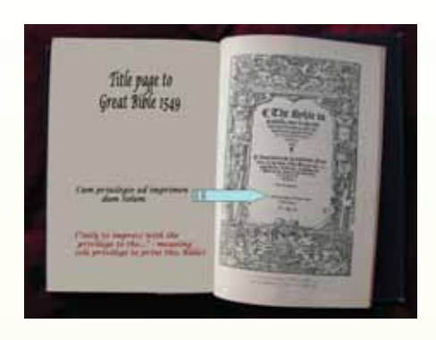
Title page to the Great Bible 1549, printed in Fleet Street, London by Edwarde Whitechurch.

King James Bibles usually include the words 'Cum Privilegio' on the title page indicating that the printer had been granted the privilege of printing the Bible. In the seventeenth century there were only three approved publishers of the King James Bible. In Scotland this monopoly was abolished in 1839. However, this restriction on who is permitted to publish King James Bibles still applies today. One new publisher has entered the arena because they are licensed in Scotland and sell Bibles. both North and South of the border. Today two printers have the rights to publish in England the King James Bible - the Oxford and Cambridge University presses - because Cambridge now own the Oueen's printer, the Evre and Spottiswoode publishing house.