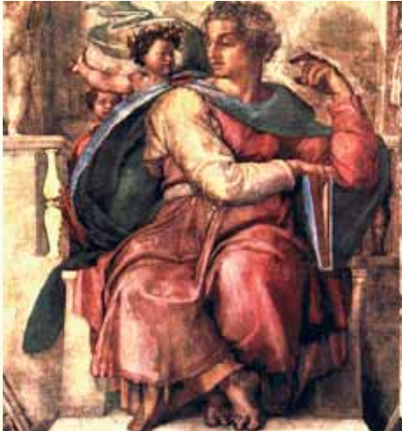
Michelangelo's portrait of Isaiah

In the opening chapter of his book Isaiah, like a doctor, carries out a health check on the nation of Judah –