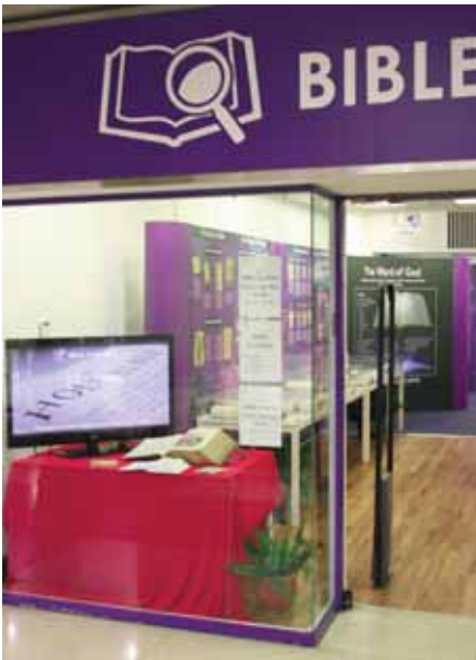
Only the Bible has the answer to the problems that now confront us

We know from elsewhere in the Bible that this will be the time when Jesus judges those who have a knowledge of God's plan and purpose with the earth and gives immortality to those who are faithful believers. In the next chapter he again addresses the state of the world during this period. First, there is this warning: