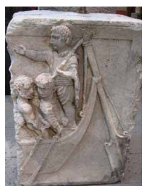
Part of the sculpture of a Roman ship showing how it was steered from the stern

They cast four anchors out of the stern to slow the ship's progress