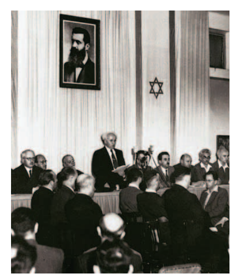
In 1948 David Ben Gurion declared the reestablishment of the State of Israel. It was the fulfilment of Jewish hopes, but it was also exactly what the prophets of God had predicted would come to pass.

In 1948, with the declaration of the State of Israel, the fig tree of the Jewish nation that had been dead for nearly two thousand years put forth leaves again. Any observer of the modern state of Israel will admit that there's still no fruit on the tree, as far as giving glory to God is concerned. This is yet to come.