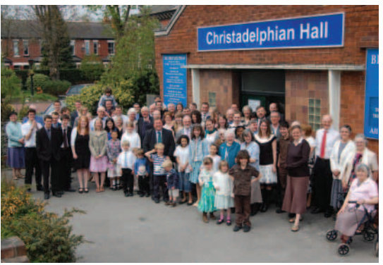
Christadelphians in Sale, Manchester, UK

"No more shall an infant from there live but a few days, nor an old man who has not fulfilled his days; for the child shall die one hundred years old ...They shall build houses and inhabit them; they shall plant vineyards and eat their fruit. They shall not build and another inhabit; they shall not plant and another eat; for as the days of a tree, so shall be the days of My people, and My elect shall long enjoy