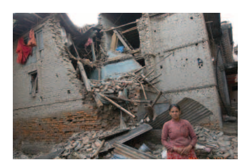
Earthquake damage in Sandku, Nepal

This really is the message of the Bible in a nutshell. God created man very good; man disobeyed God, and therefore died. The Lord Jesus came to save us from eternal death, and to offer us eternal life in the kingdom of