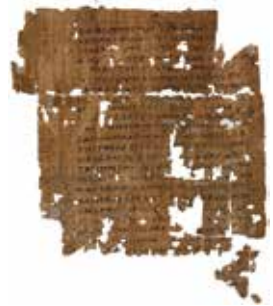
A fragment of Matthew's Gospel, c. 250AD

Second Century AD. Such is the sheer volume and quality of material that scholars are confident that the New Testament in our modern Bible is 99.5% 'textually pure'. And the remaining half a per cent where there is doubt about the original words does not significantly affect the meaning.