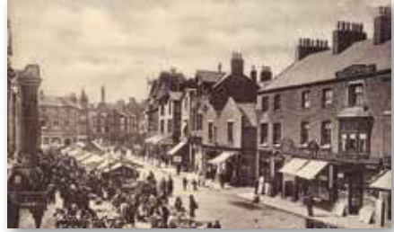
... and 100 years ago

ORMSKIRK is a small town in north-west England, well-known locally for its unique parish church, its gingerbread and its vibrant market. This outdoor market is held