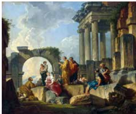
Paul preaching the Gospel

way of life. In their speeches the apostles always warned their hearers to turn away from their previous way of life to become followers of Jesus Christ.