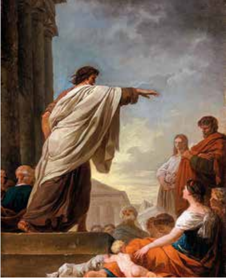
Paul preaching in Athens

In Acts 17, after Paul had been proclaiming the Gospel in Athens he was brought before the court of the Areopagus (Mars Hill) to explain his teaching. Here he gave a speech in which he again proclaimed the Gospel of Jesus Christ.