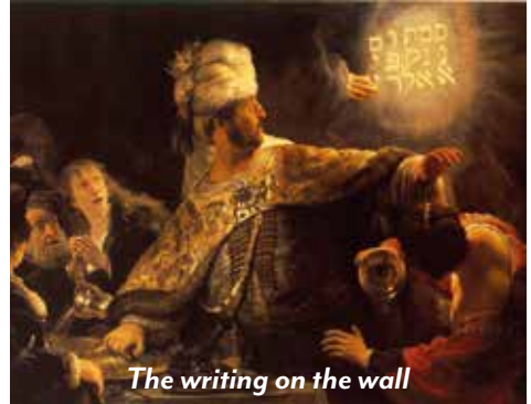
The writing on the wall

Chapters 10–11 The Kings of the North and South : an outline of history from the Persian empire to the time of the end.