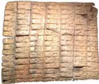
One of the tablets

But the Ebla Tablets are dated around the time of Abraham, over 500 years before Moses. We now know that Moses, with his upbringing as a prince in the court of Egypt, would have been a fluent writer. Again the Bible is proved right and its critics have to eat their words!