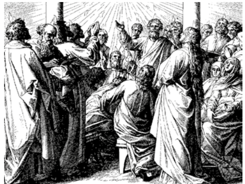
Peter preaching at Pentecost

Acts chapter 2 relates Peter's speech in Jerusalem on the Day of Pentecost, 50 days after Passover, and hence 49 days after the resurrection of Jesus. Peter had been with Jesus only nine days earlier and seen him