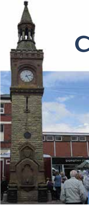
Ormskirk market today

ORMSKIRK is a small town in north-west England, well-known locally for its unique parish church, its gingerbread and its vibrant market. This outdoor market is held