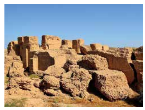
Ruins of Babylon

There are many other prophecies we could mention. The super-power of Egypt was to be defeated and to remain a 'lowly kingdom', ruled by strangers, never again to exalt itself among the nations (Ezekiel 29). The great city of Tyre was to be made like the top of a rock and never to be built again (Ezekiel 26). Mighty Babylon was to be perpetually desolate (Jeremiah 50-51).