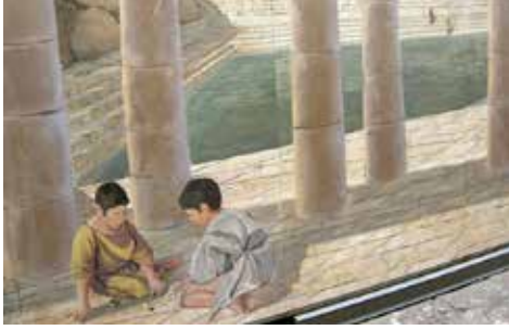
Artist's reconstruction of the pool in Jesus' day

a tunnel to bring spring water into the city as a defensive measure against an enemy siege (2 Chronicles 32:2–4 and 2 Kings 20:20). The Pool of Siloam was one of a number of reservoirs that were built during the following centuries to hold this water.