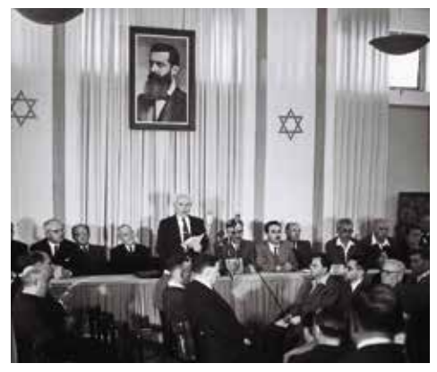
Declaration of the State of Israel 1948

At the time he wrote this book the Ottoman empire was alive and well, there was no sign of a lewish move on the land of Israel, and Europe was enjoying a period of prolonged peace. These Bible prophecies seemed very far-fetched. But within a hundred years the world had descended into a state of unprecedented unrest, the Ottoman empire had disintegrated and the first phase of the lews' return had happened!