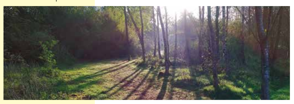
(The three missing words are on the back cover.)