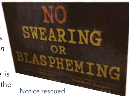
Notice rescued from a Victorian workhouse

willingly laying down his life for us (John 15:13). What does it say about us, if we repay that love by using their names as swear words?