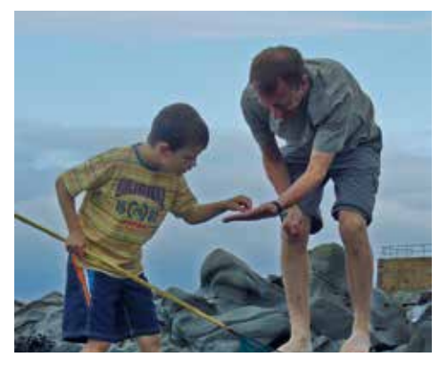
Sometimes He gives good things: 'For the LORD God is a sun and shield; the LORD bestows favour and honour. No good thing does he withhold from those who walk uprightly' (Psalm 84:11). Sometimes He

Consider that. There are those who love God and respond to His call, and those who don't. For those who have no time for God, the world can seem a cruel and unfair place. But those who belong to God have the reassurance that God is in control of what happens to them, and He is working in their life for their ultimate benefit.