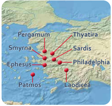
Patmos and the seven churches of Asia

Jesus' first message is to seven congregations in the province of Asia (chapters 2-3), representative of his followers throughout the world.